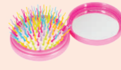
Compact Neo Pink