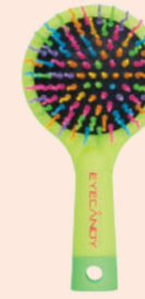
Medium Lime Green