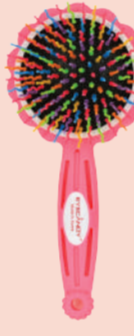
Flower Large Pink