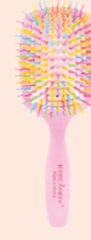
Paddle Neo Pink