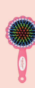
Flower Medium Pink