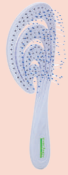
Detangling Coral Blue