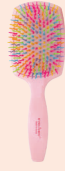
King Paddle Neo Pink