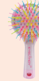
Medium Lovely Pink