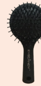
Medium Chic Black