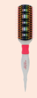
Max Volume White