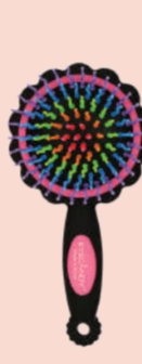
Flower Medium Black